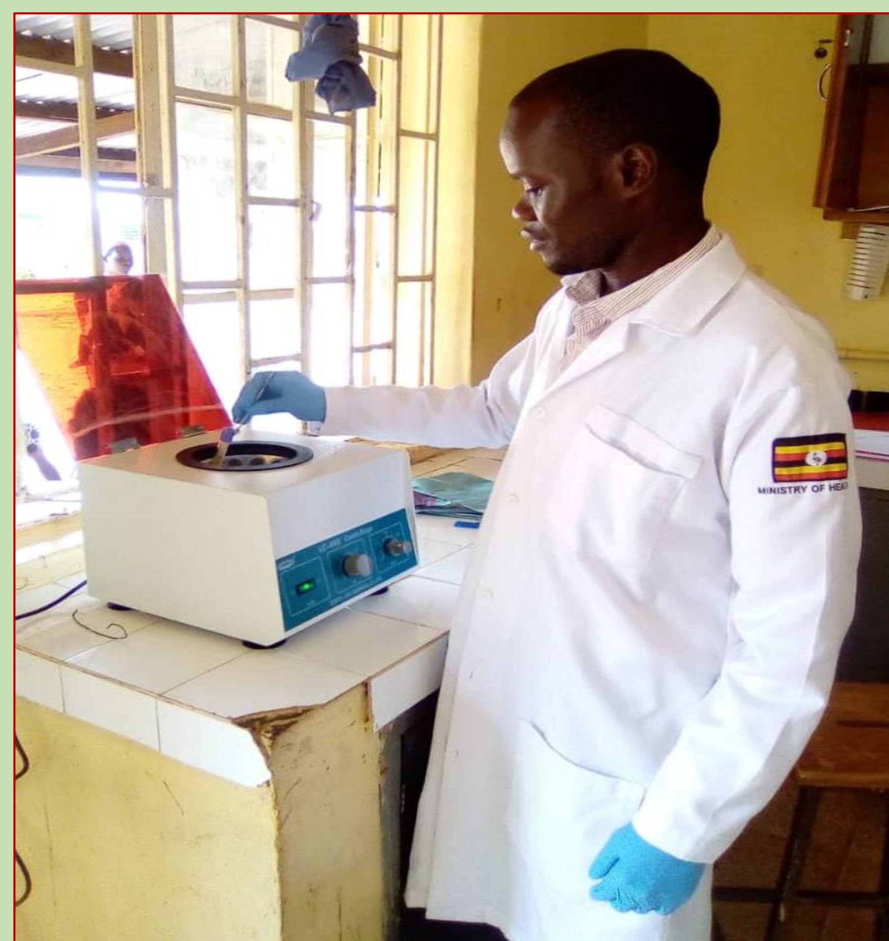
Lab staff placing Viral load samples in the centrifuge at Kibuku HC IV, Kibuku.