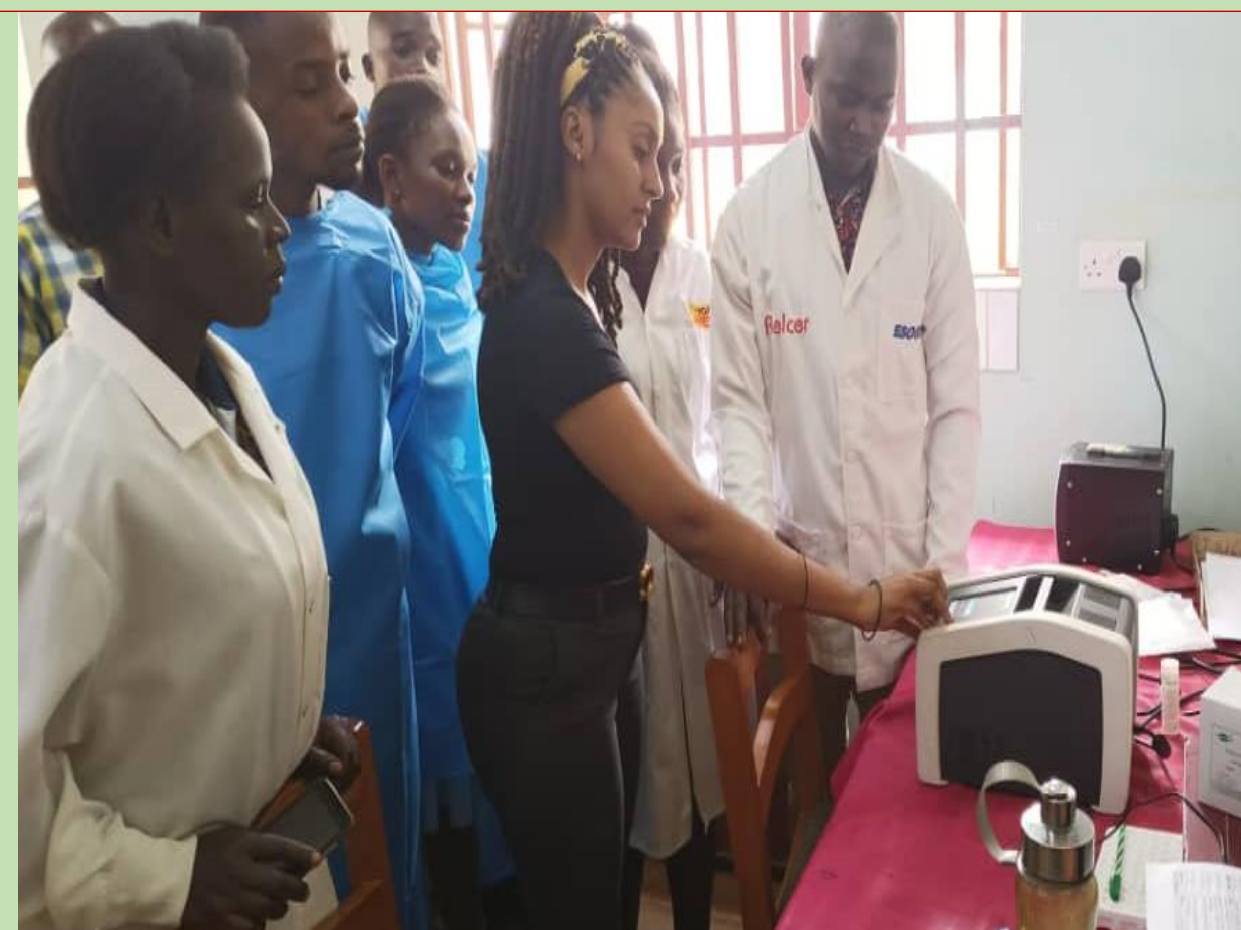
Trainer demonstrates to new lab staff how the MPIMA works at Tororo Hospital, Tororo District.